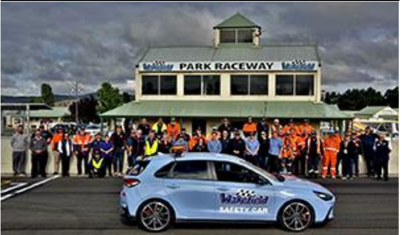
Wakefield Park Officials — the biggest team in seven years